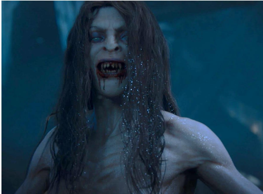
Figure 5. A Bruxa from The Witcher 3: Wild Hunt (CD Projekt RED, 2015)

Screaming or shrieking rarely damages the protagonist, rather it is used to temporarily paralyze him. That a woman's scream could be so stunning or shocking as to render the protagonist immobile and therefore vulnerable speaks to its power as a feminized weapon. As Michel Chion writes in his book The Voice in Cinema (1999), a man's cry is often called a shout rather than a scream, suggesting aggressive power or primal marking of territory. The man's shout is therefore voluntary, calculated, and purposeful, whereas "[t]he woman's cry is rather more like the shout of a human subject ... in the face of death" (Chion, p. 78). The cinematic woman's scream, then, reveals her weakness and fear – she cannot act, she can only utter a non-linguistic, involuntary scream. What of these female monsters, then, who voluntarily use their shrieks as weapons to disarm the men who threaten them? Using their voices as weapons demonstrates how these female monsters are empowered and echoes a tactic taught in many women's self-defence courses: victims are encouraged to shout and scream to startle their attackers and give them an opportunity to escape or fight back. While female monsters in these games never try to escape, they do use the moment in which the protagonist is stunned to fight back.