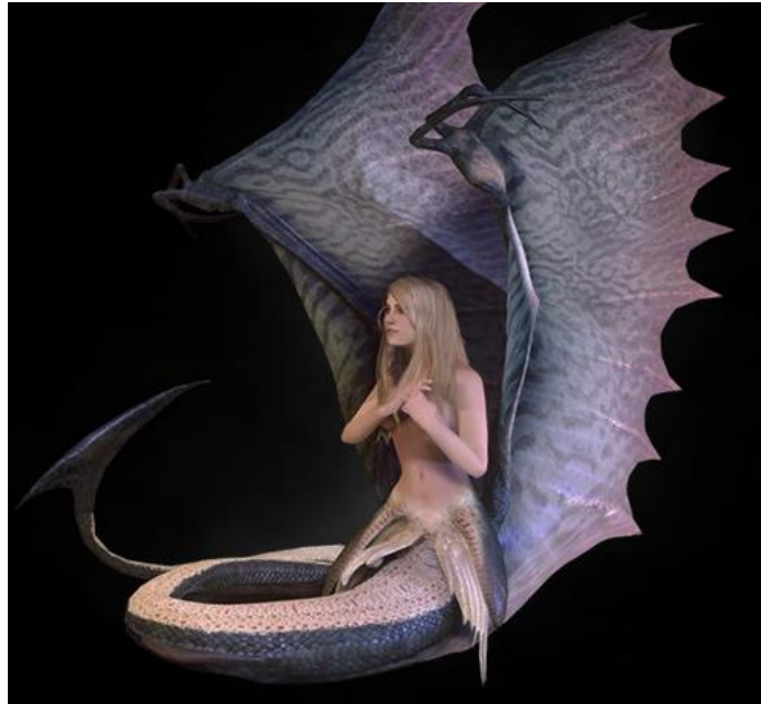
Figure 3. A Siren from The Witcher 3: Wild Hunt (CD Projekt RED, 2015)

approaches them they transform into horrific fish-like monsters with gaping, fang-filled mouths (see Figure 4). They, too, deliver an ear-piercing shriek which stuns Geralt, allowing them to swoop from the air to bite him and slash at him with their claws and tails.