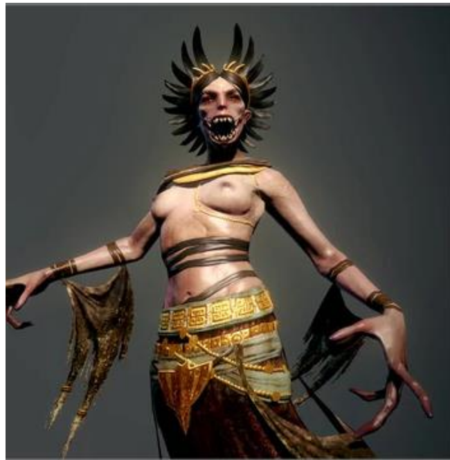
Figure 2. Siren Sybil from God of War: Ascension (Santa Monica Studio, 2013)

In CD Projekt RED's acclaimed dark fantasy role-playing game The Witcher 3: Wild Hunt (2015), the protagonist is a professional monster slayer (or "Witcher") named Geralt of Rivia. Much of the game involves Geralt slaying various monsters for money, and each monster is based on classical Western mythology or European folklore. Sirens appear as half-woman, half-serpent creatures with wings (see Figure 3). Although they appear as beautiful, naked women at first, once the protagonist