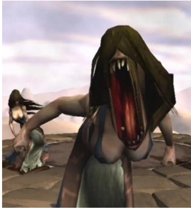
Figure 1. A Siren from God of War I (Santa Monica Studio, 2005)