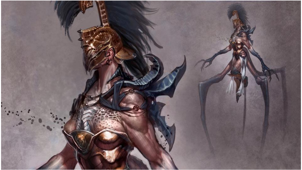
Figure 8. Megaera from God of War: Ascension (Santa Monica Studio, 2013)