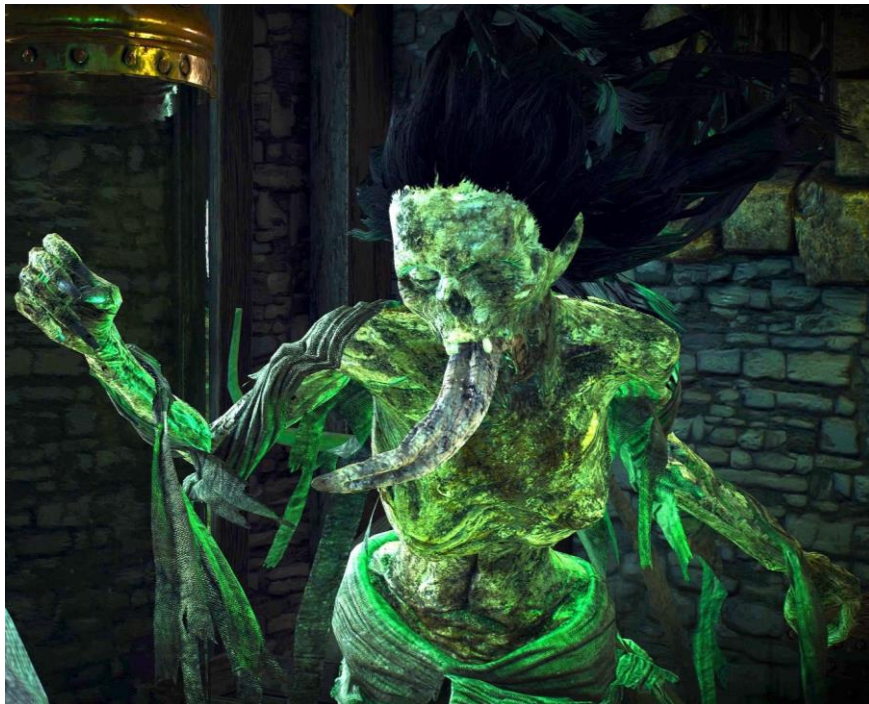
Figure 7. The Plague Maiden, or Pesta, from The Witcher 3: Wild Hunt (CD Projekt RED, 2015)

The monster is an important site of analysis because it speaks to the fears of the culture that produces it. Stephen Neale (1980) discussed horror and monstrosity in his book Genre , arguing that the monster