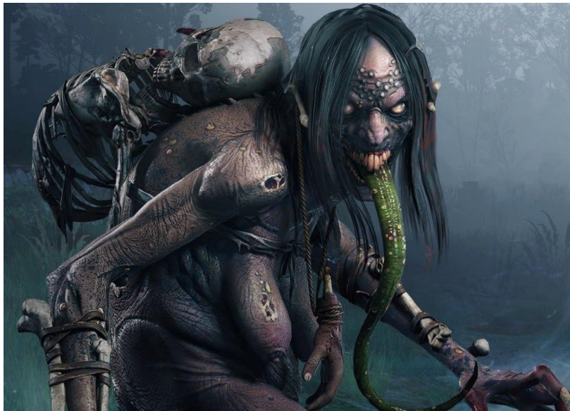
Figure 6. A Grave Hag from The Witcher 3: Wild Hunt (CD Projekt RED, 2015)

Campbell spoke of the fingers and nose, this motif could be easily extended to include the tongue. Many video games feature monsters with long, phallic tongues used to lick or stab their victims, and The Witcher 3 is no exception. In The Witcher 3 's bestiary, the Grave Hag is described as resembling "aged, deformed women" who "loiter near graveyards and battlefields" and devour human corpses (see Figure 6). These Grave Hags have long, venomous, prehensile tongues which they use to stab, lick, and whip the player.